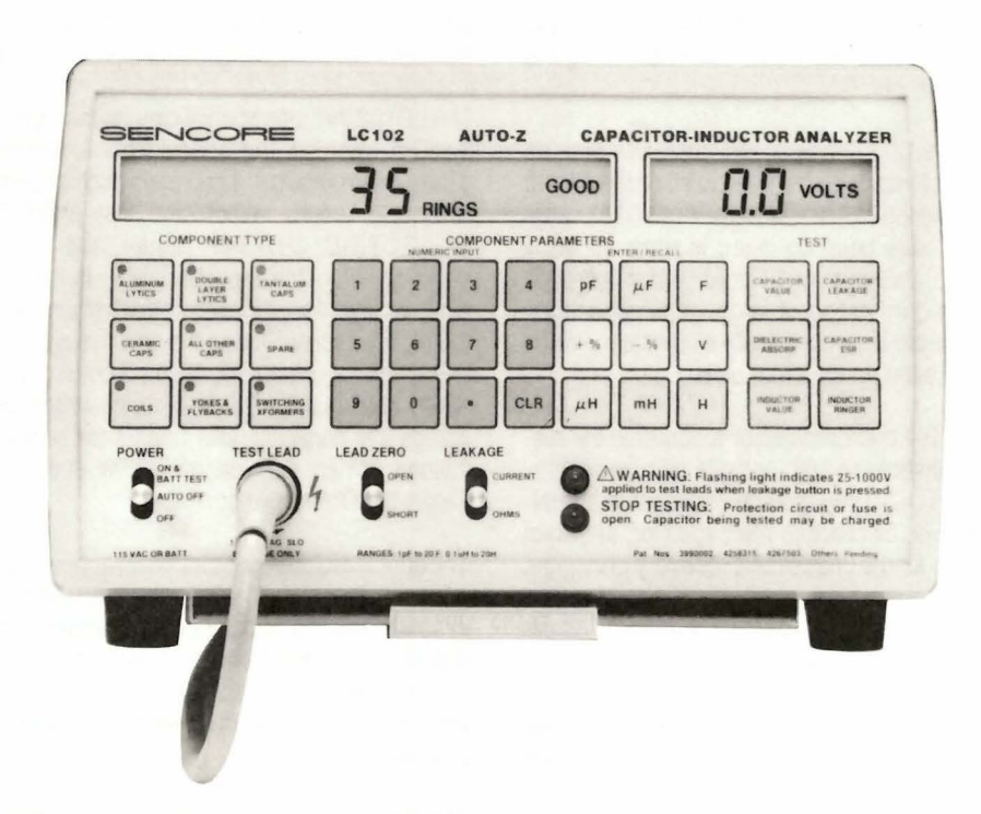
Fig. 1: The LC102 AUTO-Z — microprocessor controlled for error-free testing.

2. Electrolytics Normally Read High: All Z Meters (as well as most other digital capacitor value testers) use a DC time-constant circuit to determine capacitor value. This test method usually shows an electrolytic capacitor to have a value higher than its marked value because of the way the electrical properties of the water inside the capacitor change with frequency.